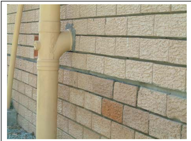
Figure 2: Evidence of movement/ settlement to the brick base along the right and left sides of the dwelling (the bed joint along the concrete slab level is larger than all other joints and has been patched at some stage).