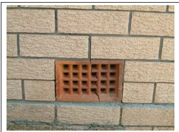
Figure 3: Cracking to the right side brick wall (up to 4mm in cracking width).