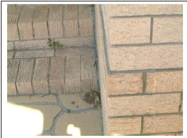
Figure 5 and 6:

Evidence of previous leakage to the bathroom metal doorframe (rust and swelling to the metal door frame).