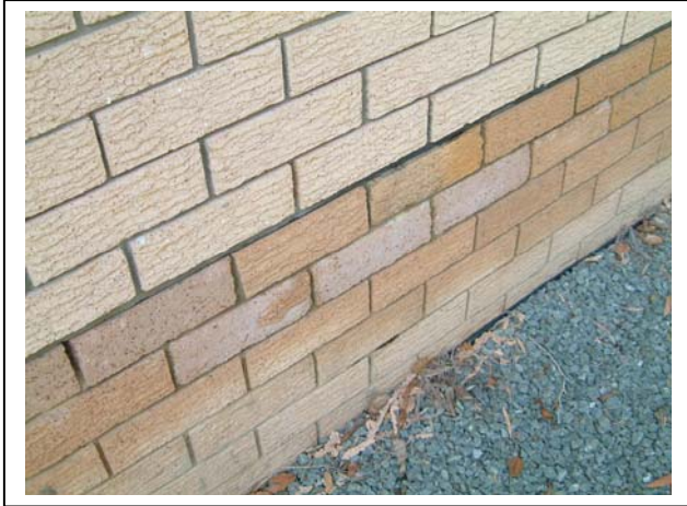
Figure 1: Fretting to various bricks along the left side and back of the dwelling.